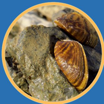
Invasive quagga mussel

With limited exception, it is illegal to transport, import, possess, or release aquatic invasive species in the United States.